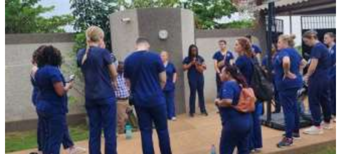
This is our medical mission team to Togo.