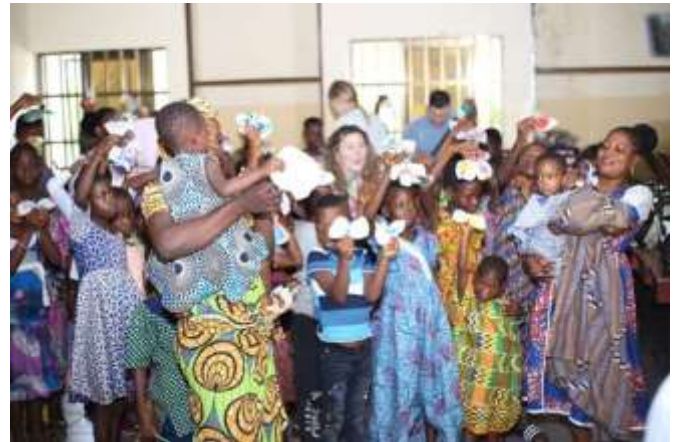
Some of the children they were able to feed and provide medical care.