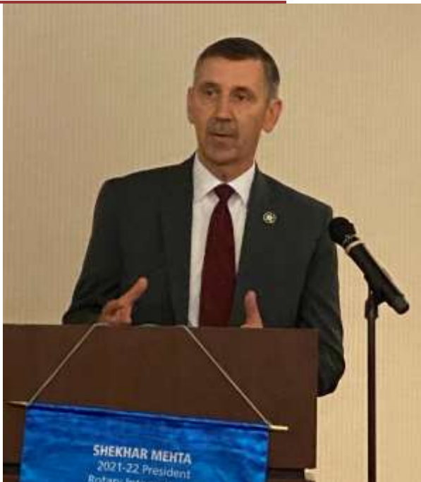
Good visit from the D.A. last week!