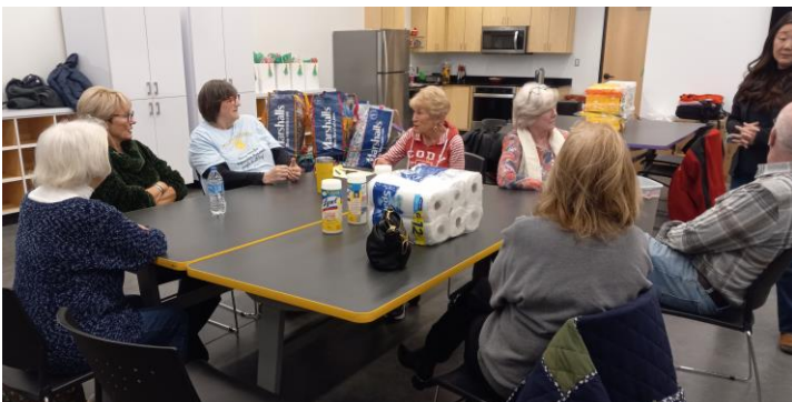
Some of our crew being briefed before starting work.