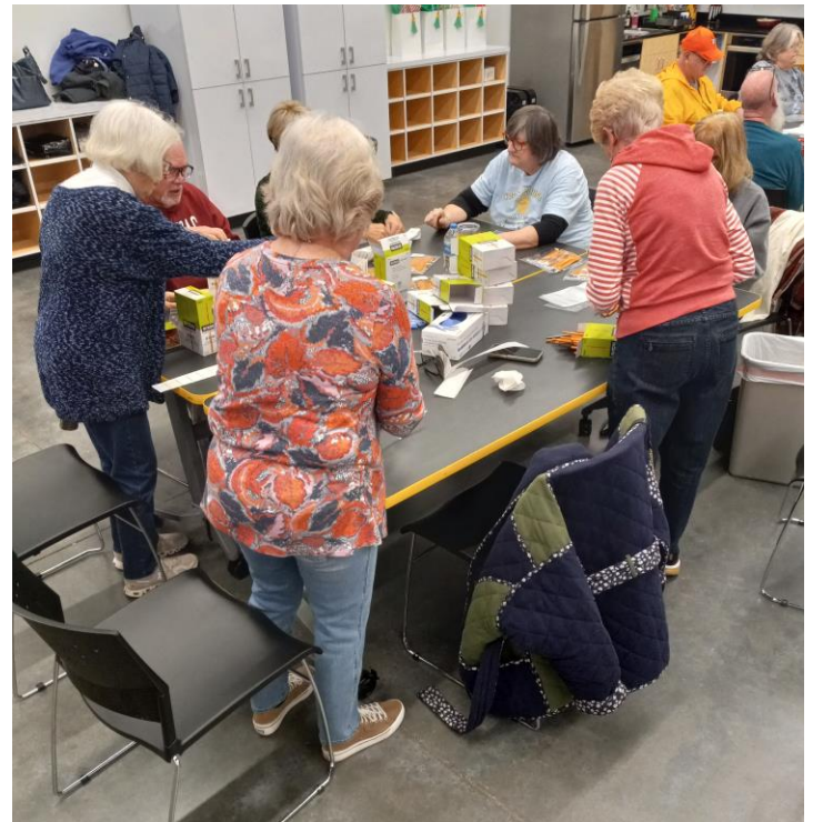
Some of our crew at work.