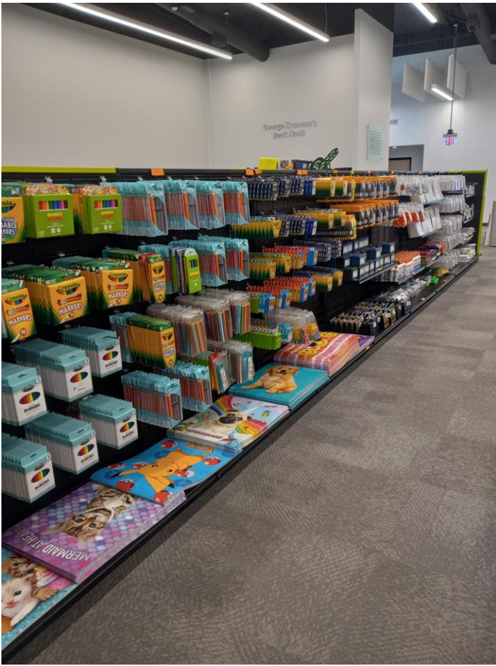
One aisle of the Pencil Box store area.