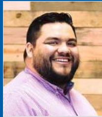
Community Service Webmaster