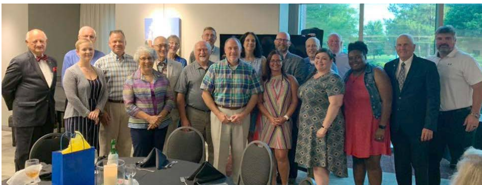
Perfect Attendance pins were awarded to the group above. With the Rotary International change to make "perfect engagement" the Rotary goal, we had additional members who contributed a great deal through service who were also awarded.