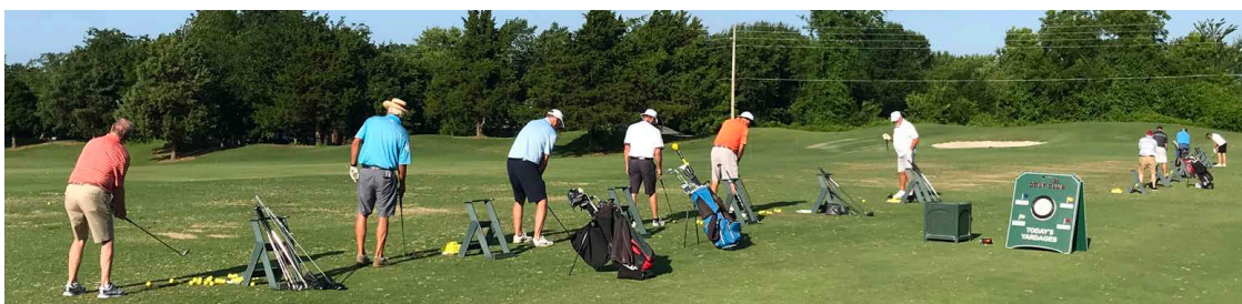
Above is a line of golfers on the Forest Ridge practice range prior to being sent to their holes for the start.

Thank you also to all the volunteers who donated items, packed the bags, managed the check-in and helped during the tournament.