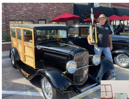
Best in Show trophy goes to Orville Adair's 1932 Black Ford Woodie!

Facebook: Cool Grilles Classic Car Show for more photos and info.