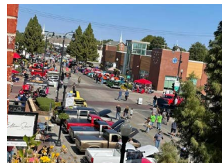
Above are photos of the excellent silent auction and competitor check-in areas. Left is an overhead view of the car show looking north. There were classic cars and trucks even in the side streets all the way to the alleys.