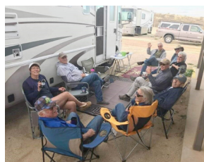
Photo from one of the RVF gatherings.

There are hundreds of Rotary Fellowships to join or you can organize a new one. Look for Fellowships in Rotary.org for existing Fellowships and also how to start a new one.