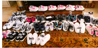
Our Club Donations so far!