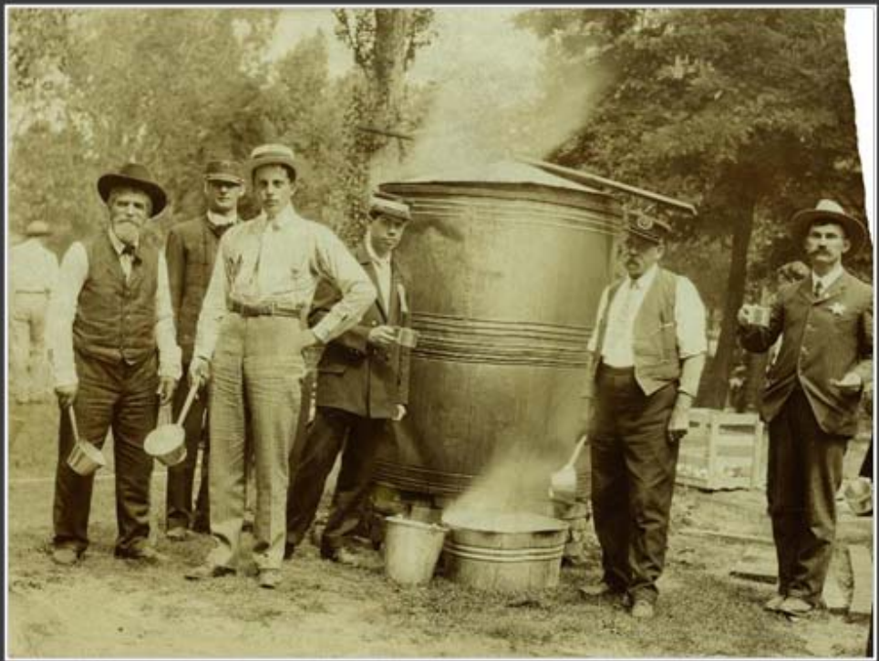
COFFEE URN AT PUMPKIN PIE DAY