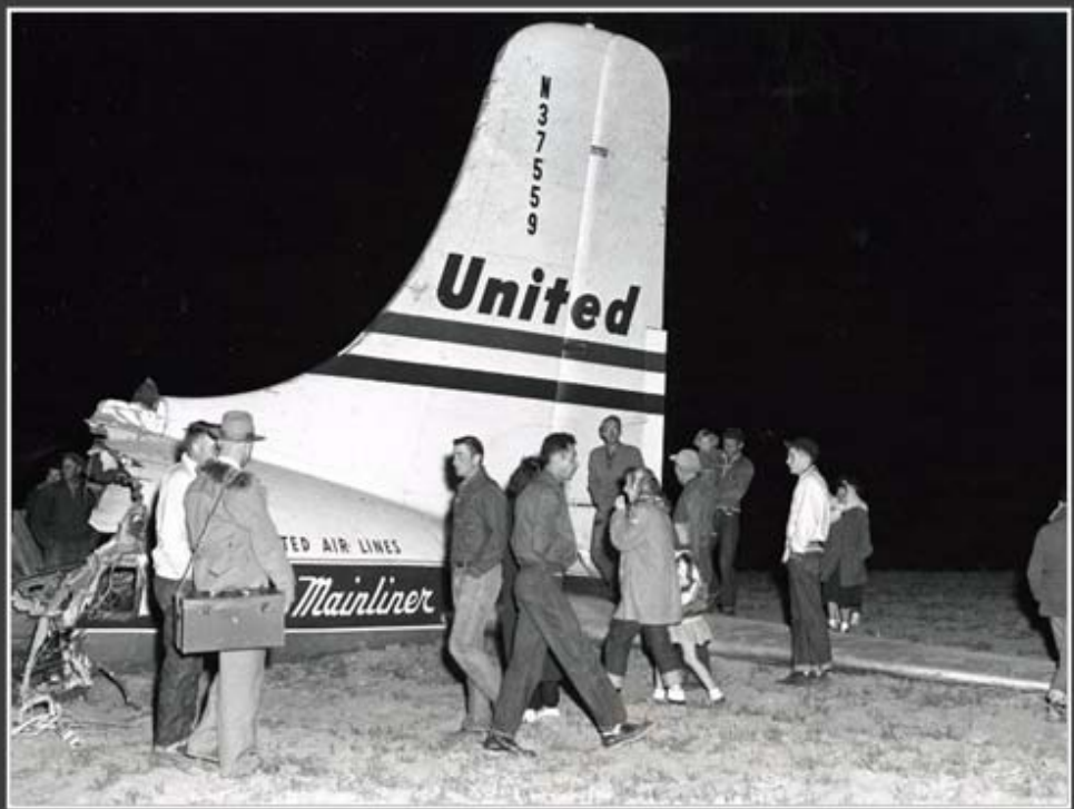
UNITED AIRLINES CRASH NEAR LONGMONT, NOV 1 1955 p. 131