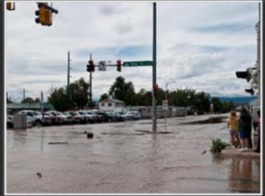
2013 flood, taken from 1 st and Main p. 176

C. Nathan Pulley photography, City of Longmont