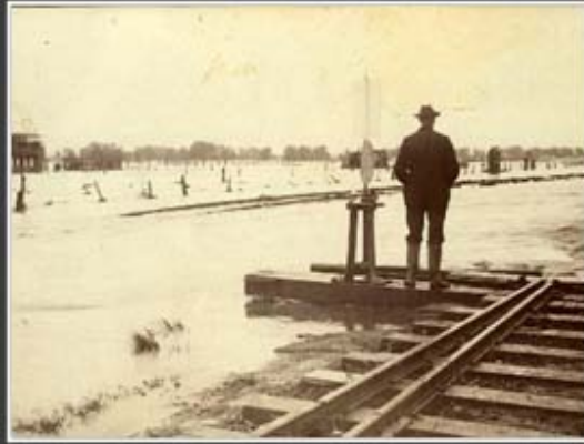
1894 flood, taken from 1 st and Main p. 79