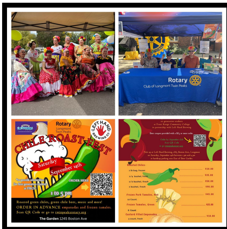
An amazing Friday: Bailes de Mi Tierra will perform at the Chile Fest Roast; Unity was crazy fun thanks to the human slot machine, video here ; and Smucker's agrees to appear on our Chile Fest Roast posters as a sponsor!