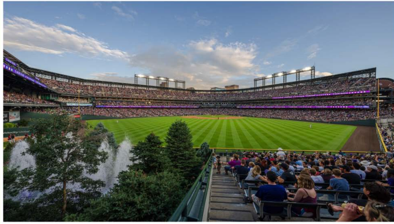
Colorado Rockies vs. San Francisco Giants Sunday, September 17 at 1:10 PM