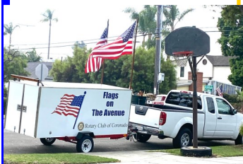
Doug's Flag Truck