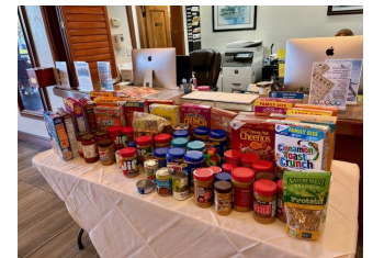
Donations to the IB Food Pantry