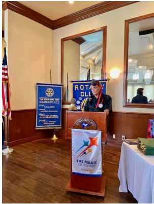
Pres. Pat kicks off National Talk Like a Pirate Day with some jokes.