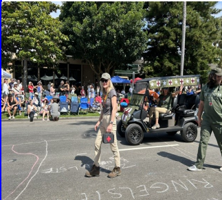
Ladies of MASH Unit 5340