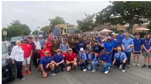
Our 4th of July parade crew and Wounded Warriors