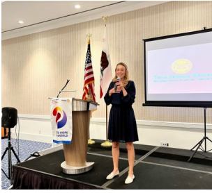
The Honorable Terra Lawson-Remer addresses pressing matters of concern to coastal San Diegans.