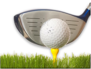
The Rotary Charity Goly Tourney is March 15th! Sign up to Play, Sponsor, or Volunteer—all hands on deck please!