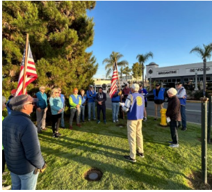
Thanks, Flag Crew, for dressing up our town with patriotic pride on MLK Day!