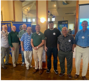
We had a whole crew of Red Badgers “graduate” today. Congrats to our new Blue Badgers!