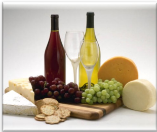
Wine Tasting tickets are now on sale! Get yours before we sellout for this popular fundraiser on Sept. 9th!