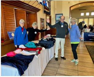
A big thanks to our Haberdashery Crew for keeping us looking sharp in Rotary logowear!