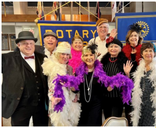
Our Dapper Rotary Chorale serended us in honor of our club's 97th birthday!