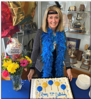
Madame President in her 1920's finery—Happy Birthday to us!