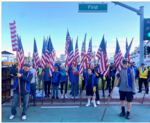
Our Flag Brigade making us proud on Presidents Day... Looking good, everyone!