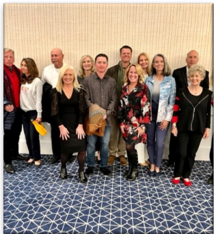
We are very grateful to this fun modeling crew for stepping out of their comfort zone and onto the runway! Well done all!

We were just informed of Bill Green's passing . Condolence cards can be sent to 1025 Park Place, Coronado, CA 92118. Information on services will be forthcoming.