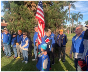
Honoring our Veterans and our flag on Veterans' Day. Thanks, Flag crew!