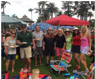
Get ready for the Rotary sponsored Concert-in-the-Park on July 31st featuring "Full Strength!"