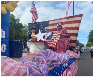
More 4th of July Parade fun on our award-winning float!