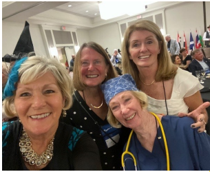
These wonderful ladies represented us well at last weekend's District Conference.