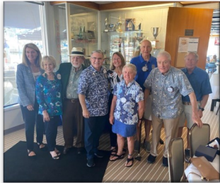
We also honored a "major" group of Major Donors. Thank you ALL for your incredible generosity!