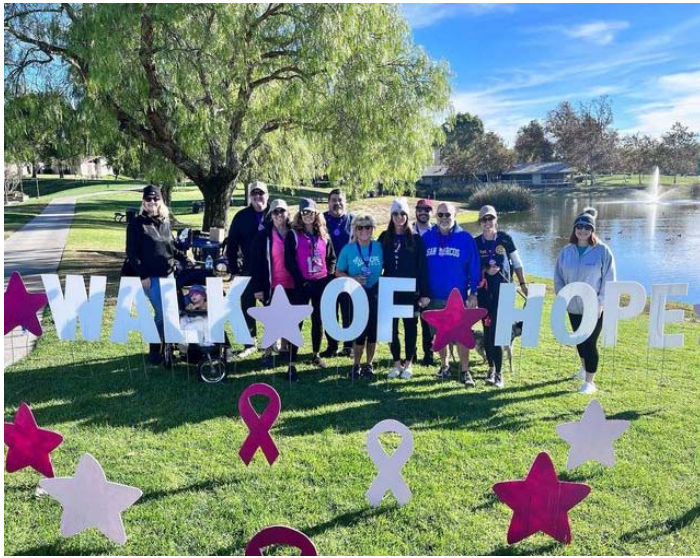
Team Rotary Club of Temecula at the Michelle's Place Walk of Hope. ??????