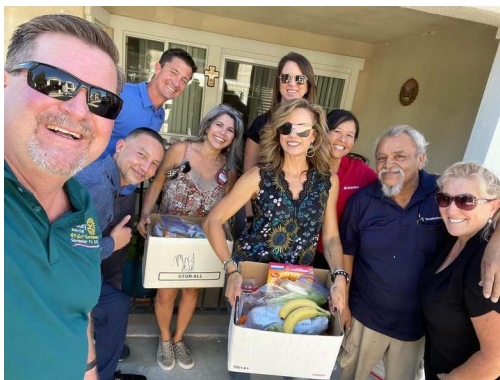
Our last delivery of food to seniors this year! Great work team!