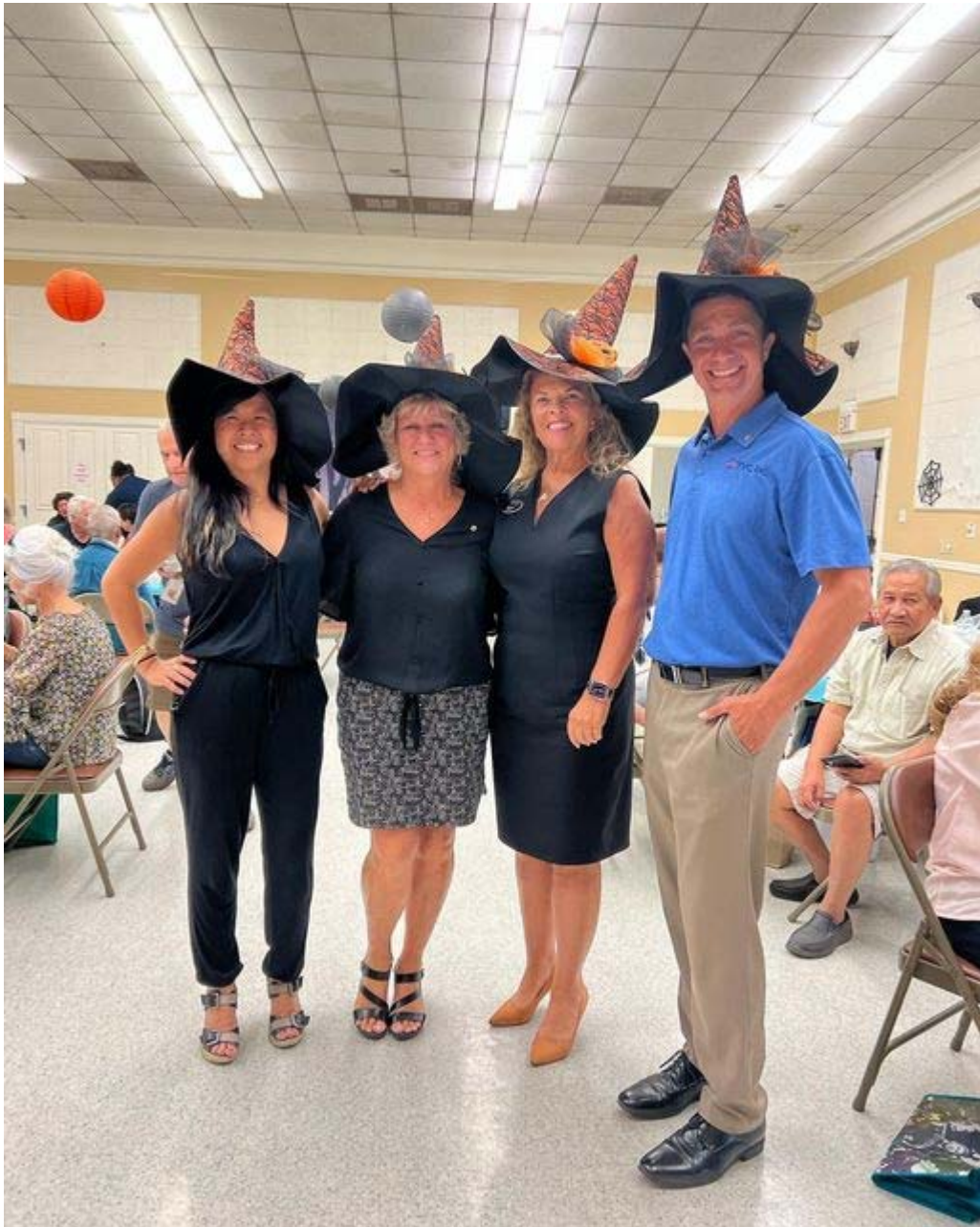
Senior Committee celebrating Halloween at the Senior Center.