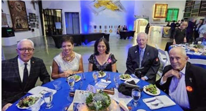
The dinner was held at March Reserve Air Force Base in Riverside, CA. Next year the dinner will rotate back to our side of the district. You should plan to go!!