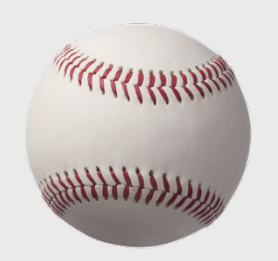
TAKE ME OUT TO THE BALLGAME (See next page)