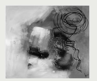
CULTURE FIX Walter and Jack takes us on a visit to our iconic art museum. You will never look at modern art the same way!