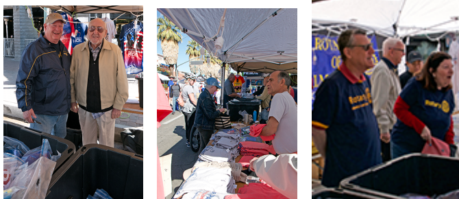
Happy Rotarians !