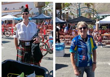
Happy Customers !