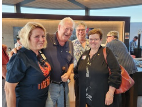
Firebirds Game Event!