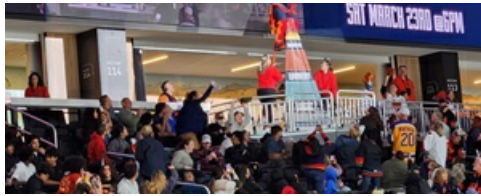
Coachella Valley Rotarians