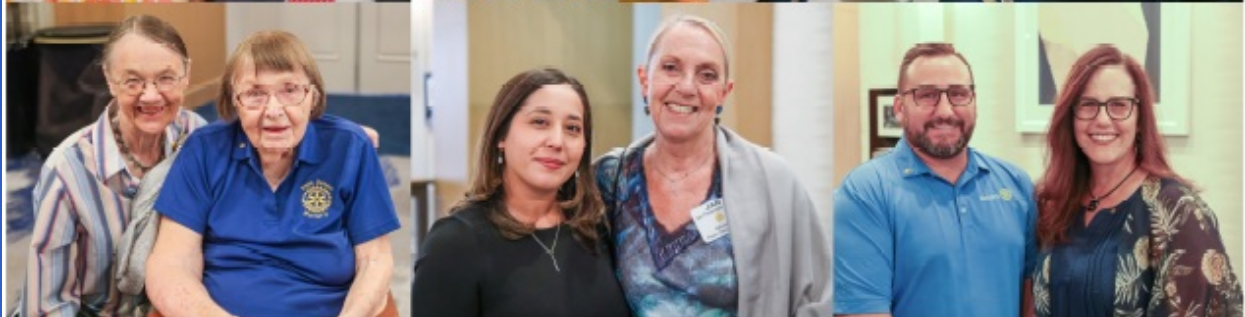
Pancake Breakfast Scenes