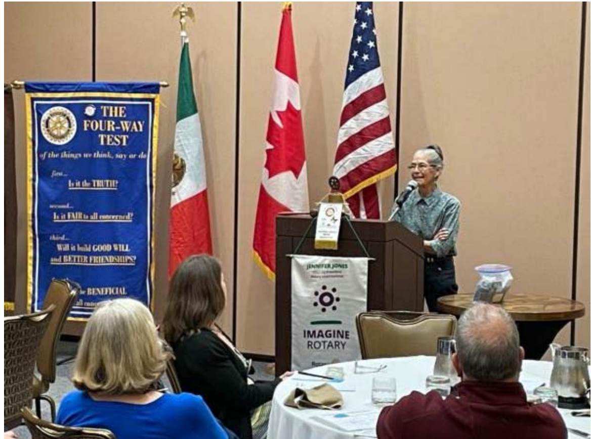
Rotary Club of Indio February 28 Meeting