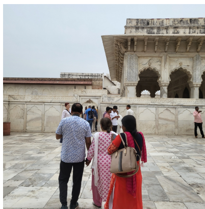
Where the Emperor met with "regular" folks.