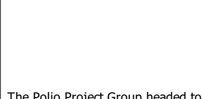
The Polio Project Group headed to