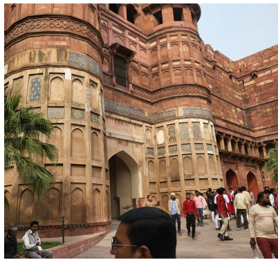
Agra Fort where royalty lived.