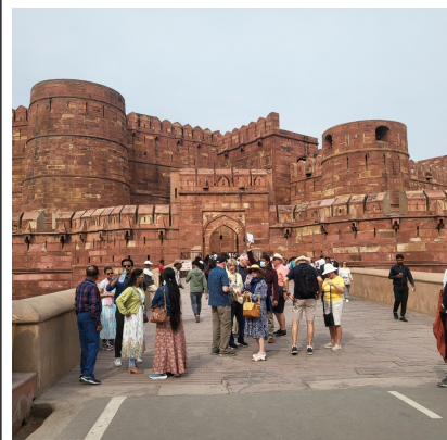
There were 2 moats. One filled with animals, the inner one filled with water & crocodiles.