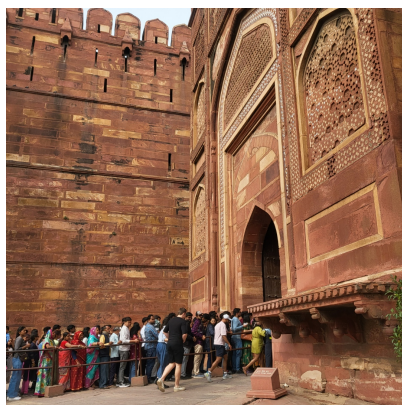
This arch was tall enough for the Emperor to enter on an elephant.