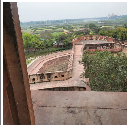
The Taj Mahal in the far upper right of the photo.