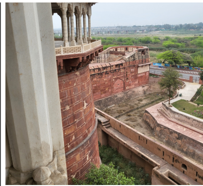
This part was the jail.