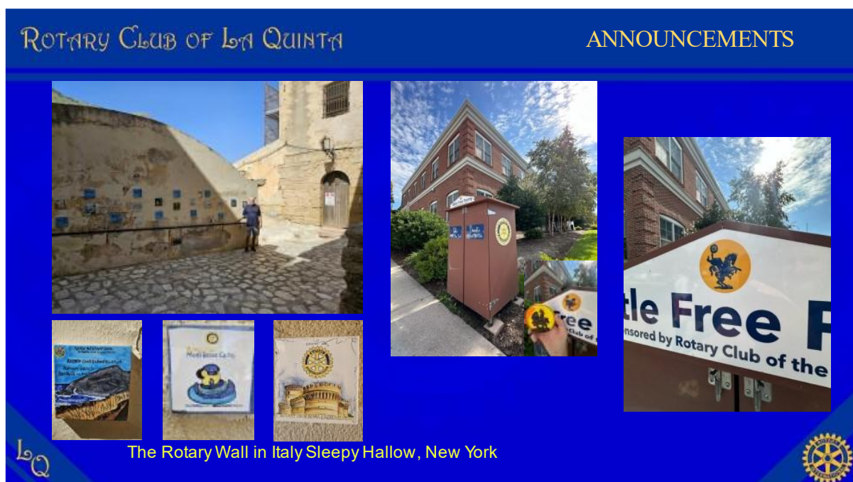
The Rotary Wall in Italy Sleepy Hollow, New York