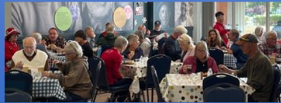
Mizell's Luncheon Attendees