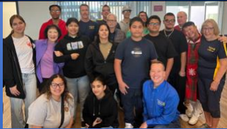
Sunup's Gift Packing Crew