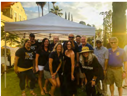
Ushering at the Redlands Bowl