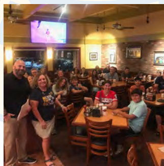
PRYDE Planning 2023