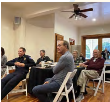
The Cool Kids Table!