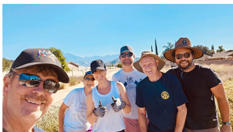
Orange Blossom Trail Cleanup Crew October 21, 2023