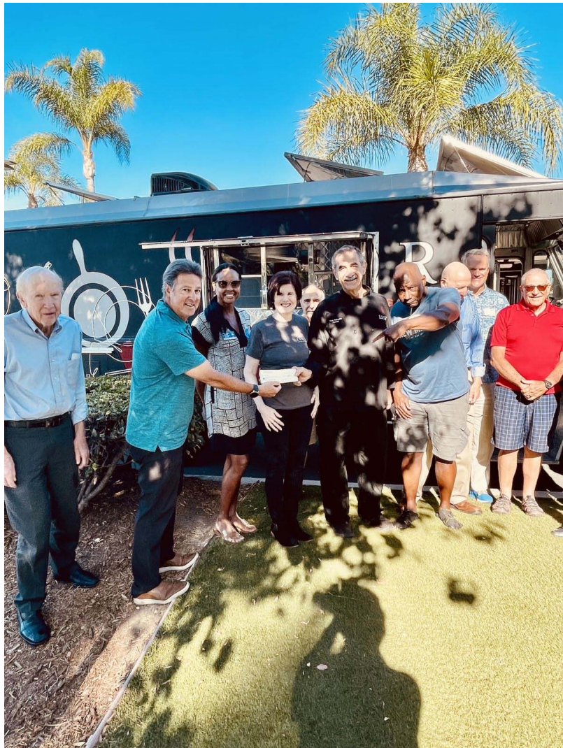
Presentation of $1600 Donation raised by Wine Zoom