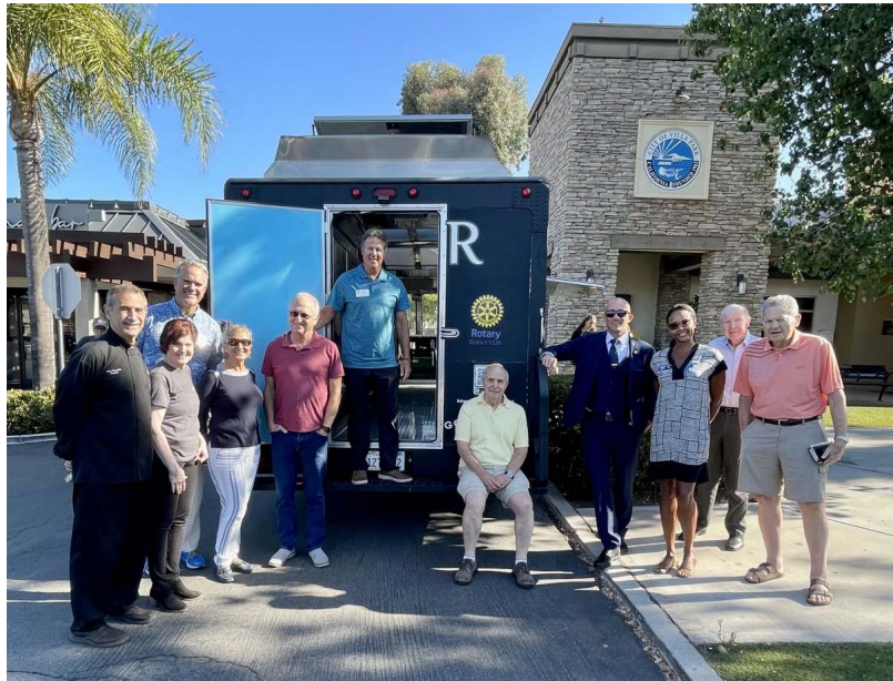
Rear of the truck with the Rotary Wheel