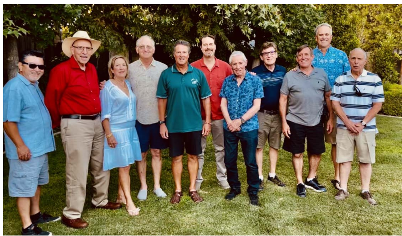
Outgoing Board 2021-2022