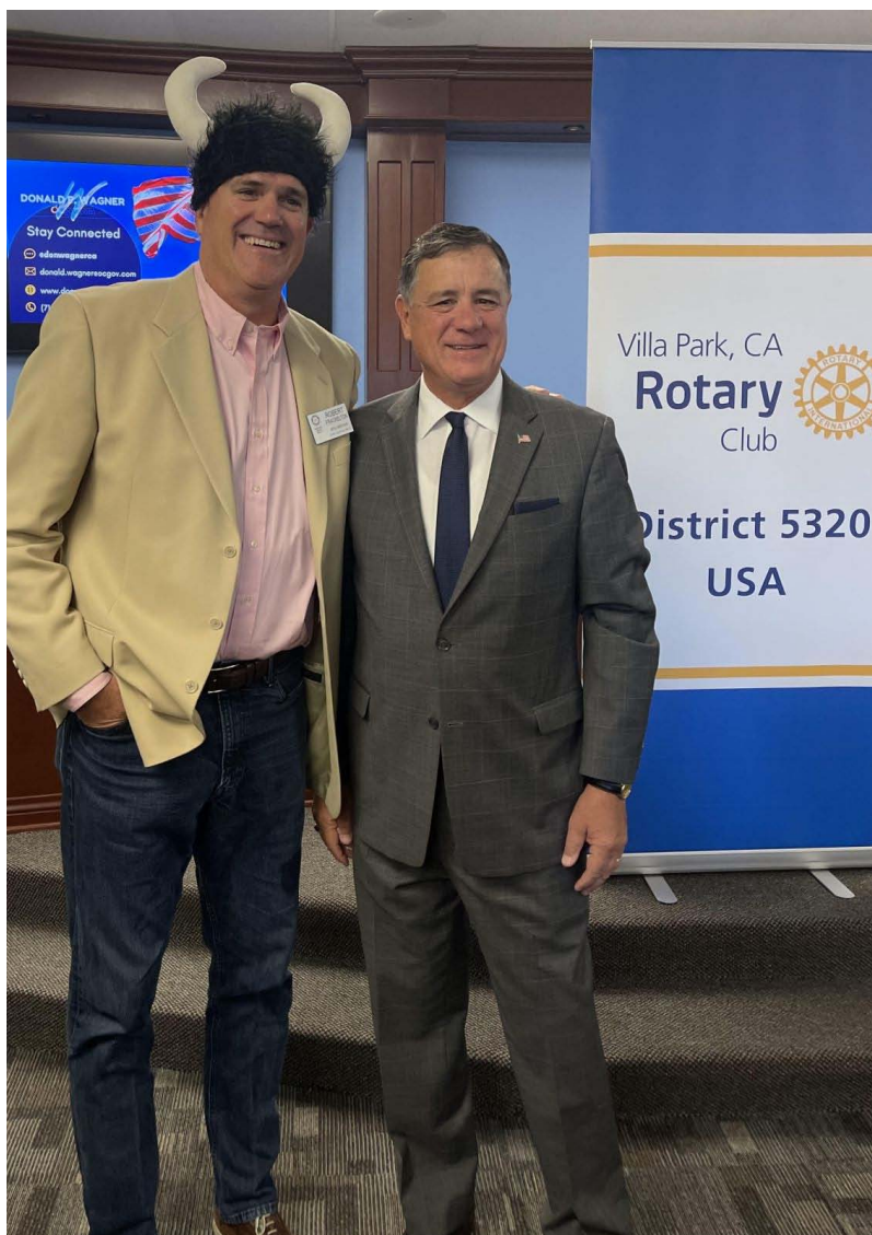
The Grand Poobah meets the Real Poobah