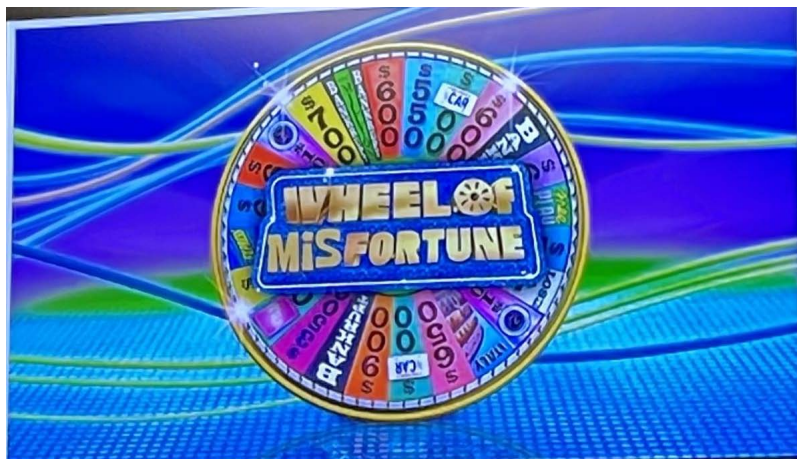
Wheel of Misfortune

This will be a special dinner for members of the club and friends. That will include: appetizers, a choice of entre, dessert and non-alcohol beverages - $75/person includes tax/tips - Contact Steve to sign up.