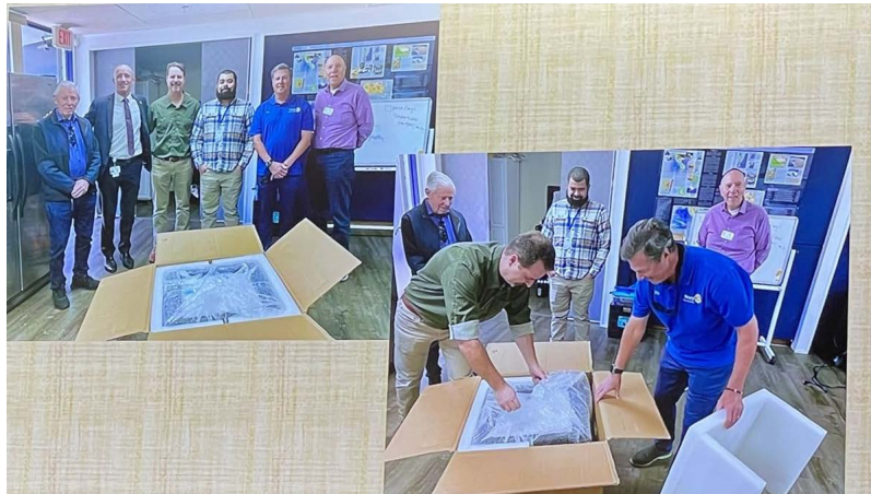
Unpacking the #-D Printers