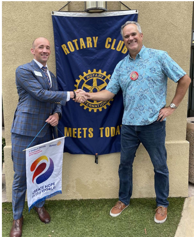
Peaceful Transfer of Power July 6th 2019 Opening:

By Jay Applebaum on Thursday, July 6, 2023