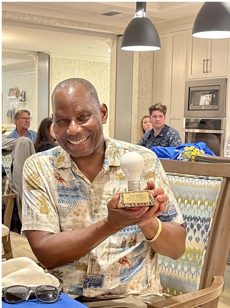
Our Wheel of Misfortune Sheriff Gets An Award at the Demotion Party Upcoming Dates :