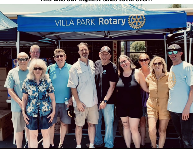
After expenses we made about $147,000 and the club should receive $55,000