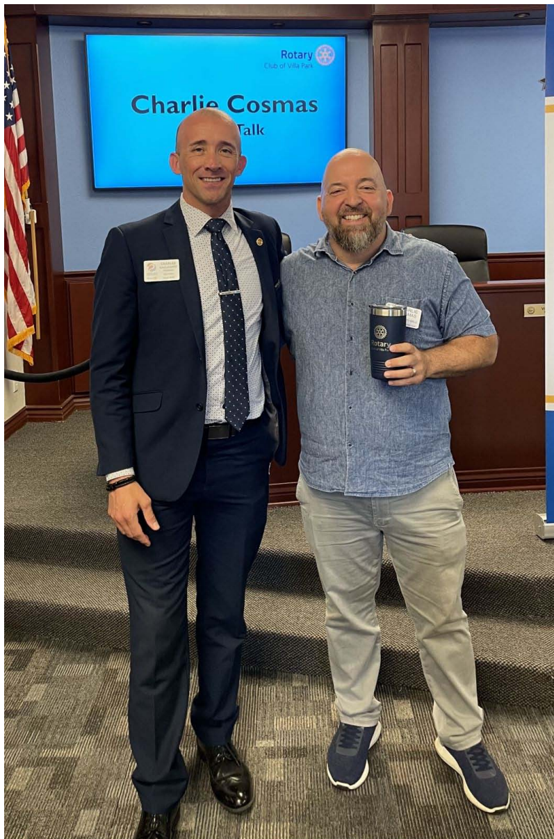
The 2 Charlies Final Quote: