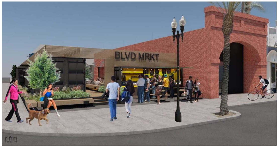
Concept for 520 W. Whittier Blvd.