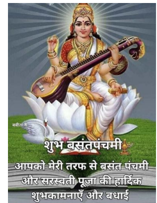
Celebrating the start of spring in Nepal at Laligurash School, Mirge Village